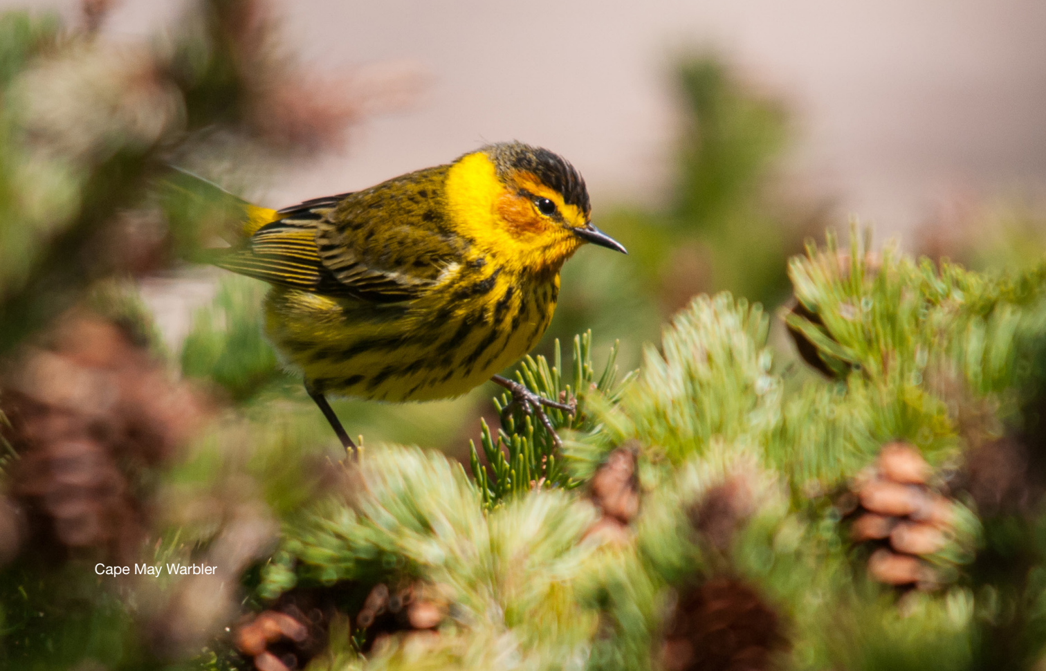
Cape May Warbler