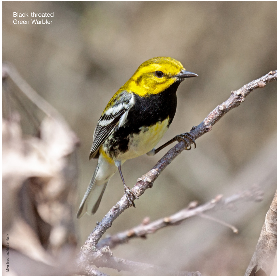
Black-throated Green Warbler