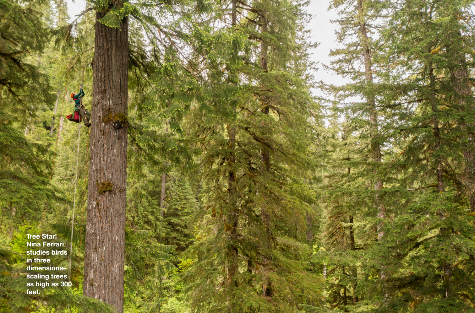
Tree Star! Nina Ferrari studies birds in three dimensions— scaling trees as high as 300 feet.

towering old trees, standing dead snags, downed logs nourishing new life, and multi-layered canopies filtering sunlight to understory leafy plants. I prefer the term “ancient forests.” After more than a century of logging, the remnant forests are more precious than ever.