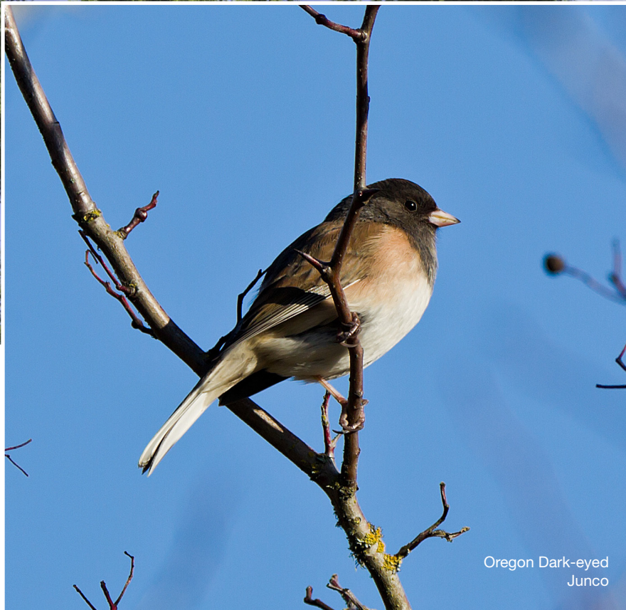
Oregon Dark-eyed Junco